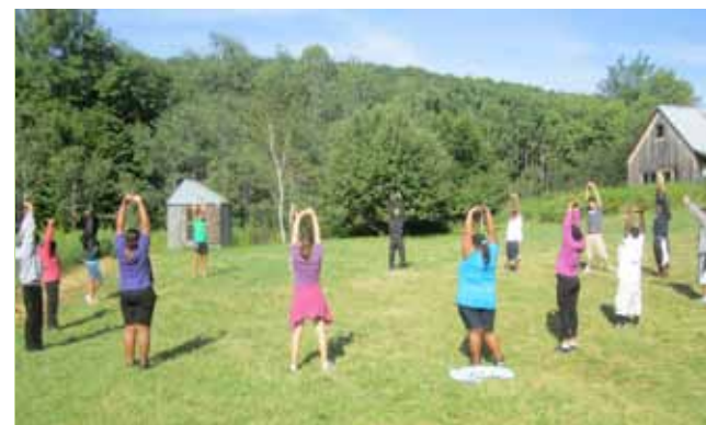
Daily physical fitness out in the field gets everyone ready for the day