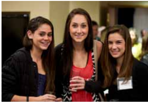
Young philanthropists with the Make the Dash Count Foundation that supports EV

To all who helped in any way, thank you, thank you, thank you!