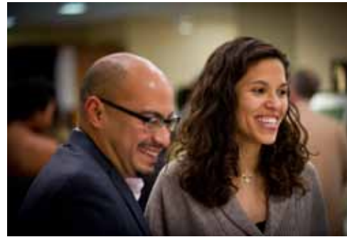
EV friends enjoying a light moment at the Gala