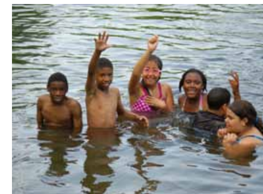
Cooling off at the nearby spring-fed pond