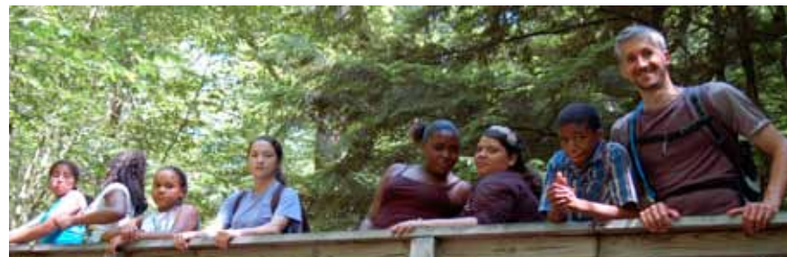
Crossing a bridge on the Clark Brook Trail on the slopes above EVcamp

with fun, and the breathtaking beauty of the pond, lake and surrounding trees and wildflowers never ceased to astonish me. Dinner prep, singing, name game, and evening reflections rounded out the day, and provided a comfortable and unifying space for everyone to be together and appreciate each other. I found that the supportive and collaborative environment of camp, along with the constant engagement and activity, created a healthy balance between energy and reflection. The philosophy is unique and comforting, and is what helps build such meaningful and community-oriented bonds amongst us based in honesty, trust, and faith.