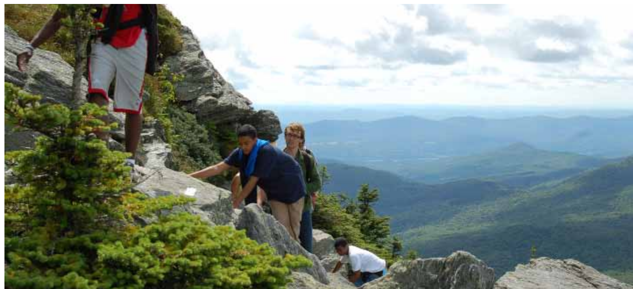
Step by step, together "to the top!" EVkids approach the peak of Camel's Hump, the second-highest in Vermont. To kids growing up in urban centers like Dorchester and Roxbury, the hike looks impossible, especially from a distance. Putting one foot in front of the other, with support and encouragement, they learn that they can reach goals they hardly thought possible.