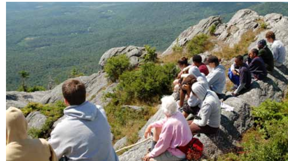
EVkids expand their horizons atop Mt. Hunger in Vermont. On their first hike at EV camp last summer, staff and campers contemplate how far they have come and the higher peaks still ahead.