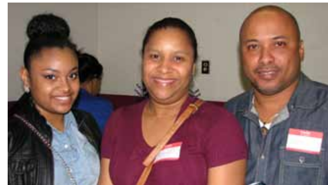
EVfamilies enjoy the Community Event