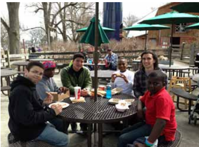
EV outing at the Franklin Park Zoo