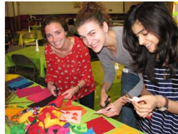
EV corps tutors prepare the crafts table

EVkids and their tutors from Harvard and Boston College put on an evening of entertaining performances, prepared over several previous weekends, to an enthusiastic audience. Check out all the pictures on Facebook at "Earthen Vessels (EV)"! Additional pictures on the back page.