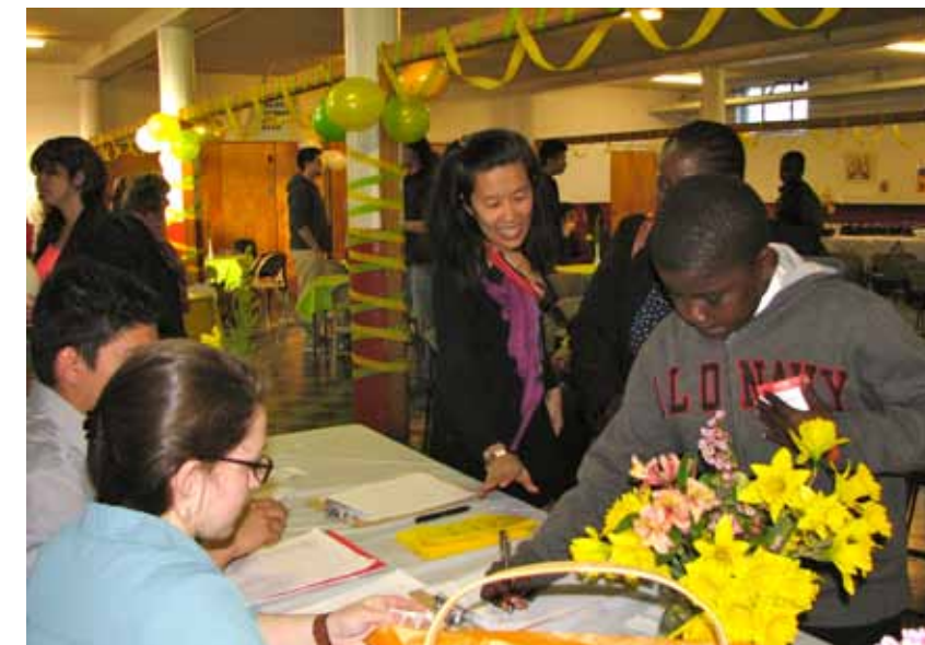
EV staff, EV tutors, and EVkids worked hard to prepare a superb event